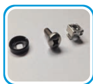
SCREWS, WASHERS & CAGED NUTS