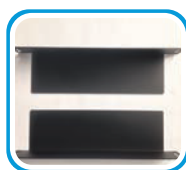
19" RACK SHELVES