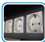
CABLED POWER OUTLETS